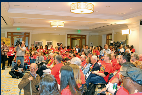
left: MTA members and Fund Our Future coalition partners gather for a day of action at the state house.

She then kicked off a loud march around the State House, with music by the Second Line Social Aid & Pleasure Society Brass Band. When marchers turned the corner back onto Beacon Street, they tied hundreds of red ribbons to the wrought iron fence in front of the State House. It was a visual reminder that the people's business on behalf of students, educators and communities is far from over. ■