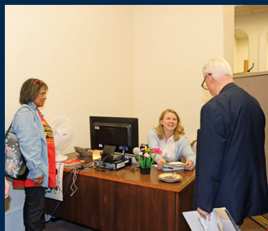
center: MTA Retired members meet with legislators to promote the passage of Fund Our Future legislation.