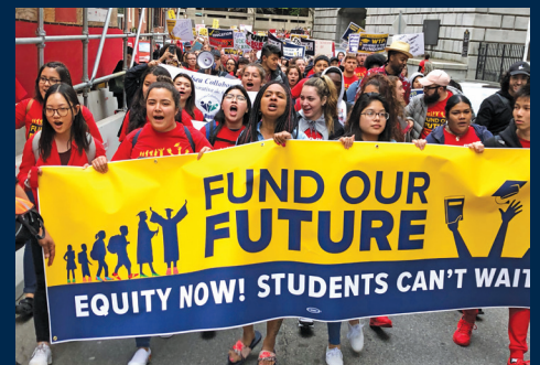
right: Local students lead the march around the state house.